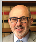
Hon. Judge Zaven V. Sinanian